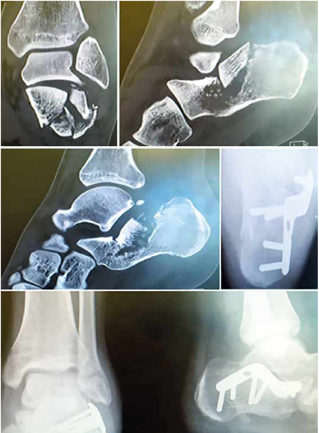
Figure 2: Pre-operative CT scan of a 28-year-old patient with a displaced intra-articular fracture and post-operative radiographs following operative fixation using the Wave plate.